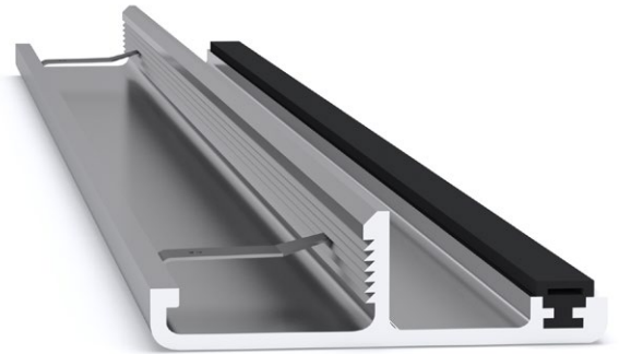
25S - Bottom View