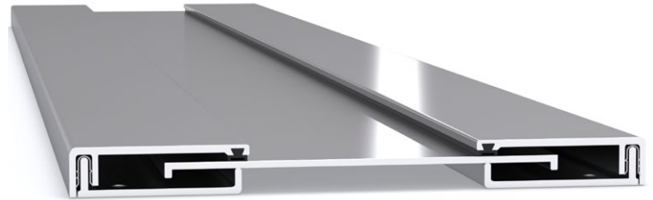
75K - 150K