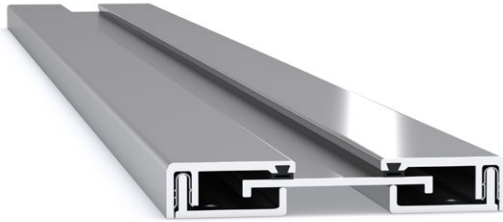
25K - 50K